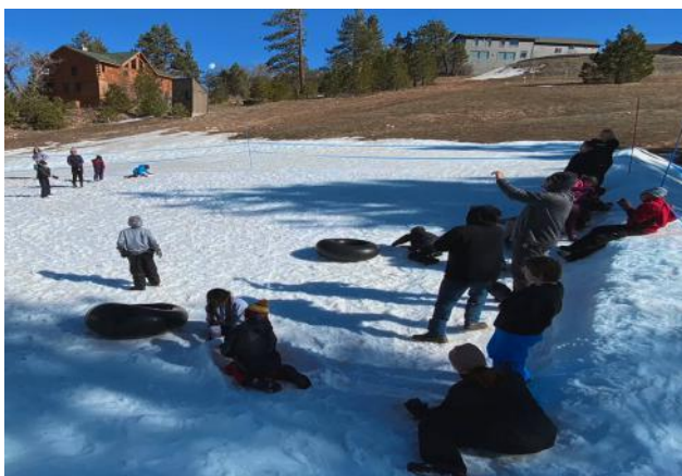
Ski trip to Big Bear Mountain.