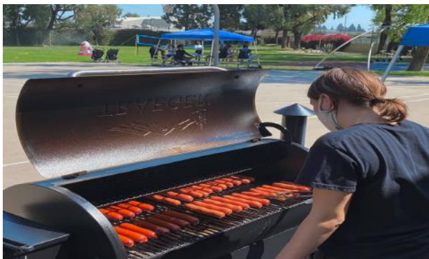
Labor Day cookout on Orangewood's new BBQ smoker.

Thank you to all who participated in our election. We appreciate your time and interest.