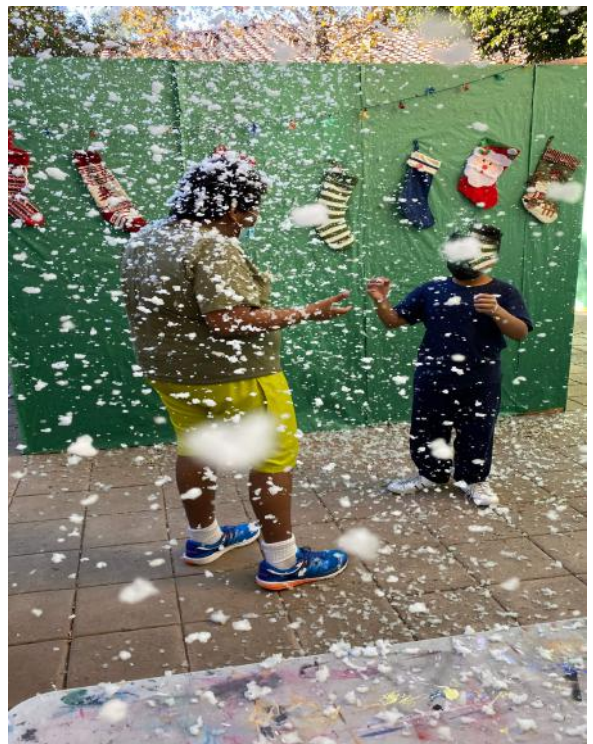
A snow machine helps to transform Orangewood into a winter wonderland.