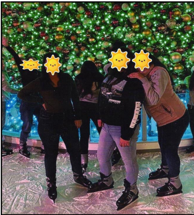
Orangewood residents ice skate at Irvine Spectrum.