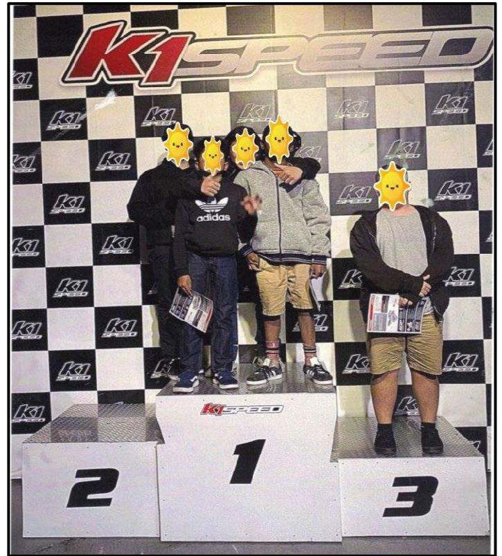
Orangewood residents race Go-Karts at K1 Speed in Irvine.